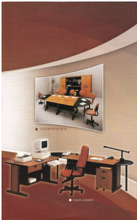
Modera V Class 4